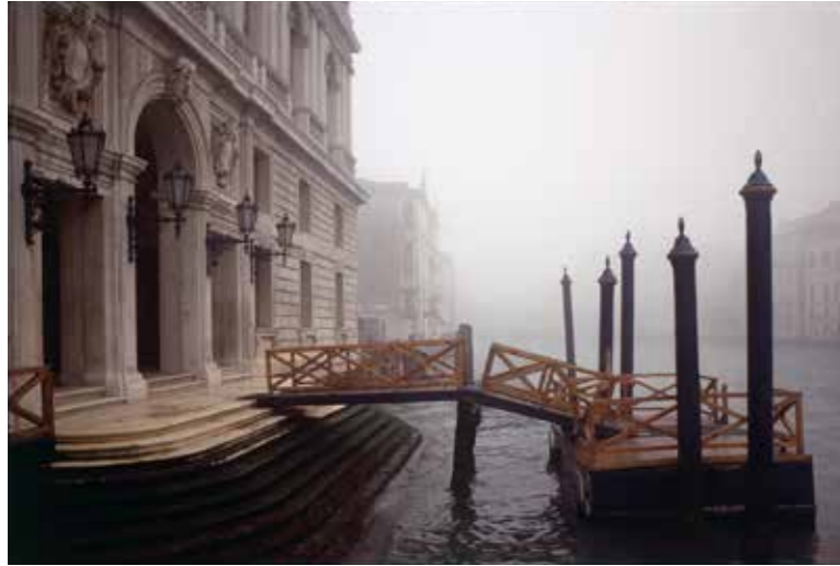
Above left: Palazzo Grassi, Venice, c1980s Above right: Palazzo Grassi at Night, Venice, c1980s