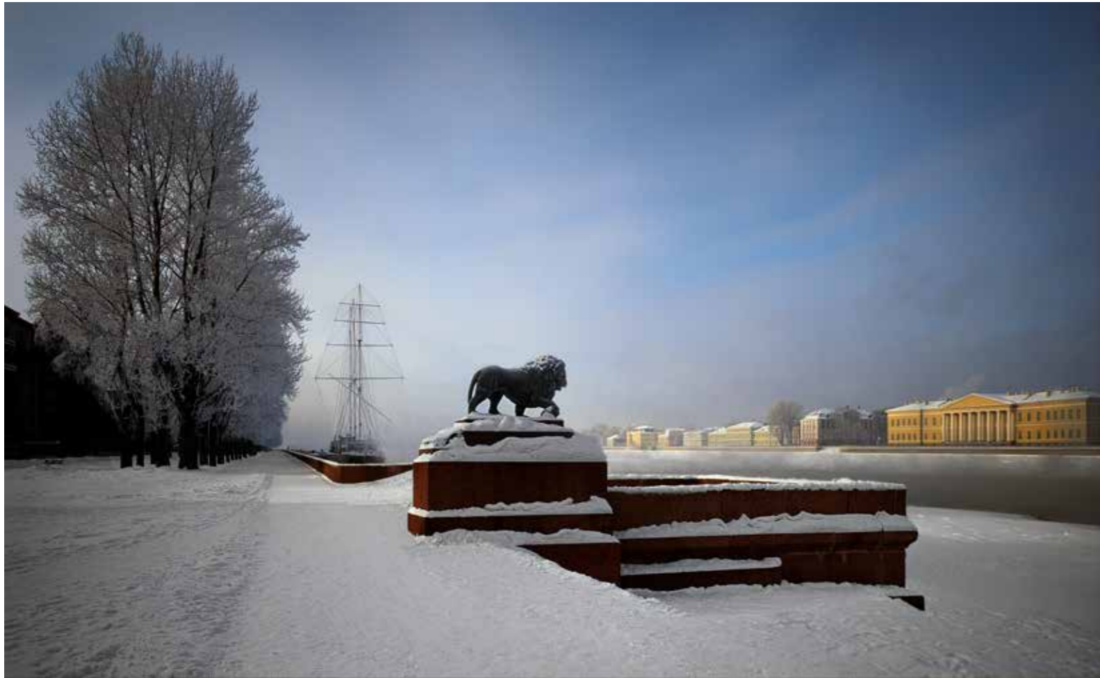
Below: Neva and Lion, St Petersburg, c1980s