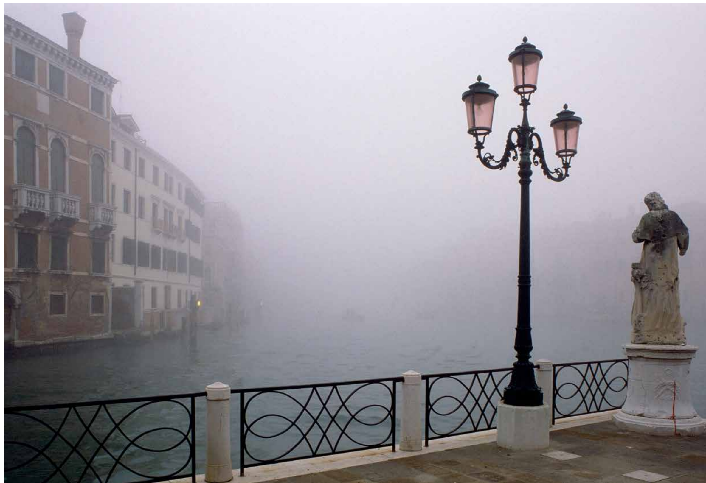
Above: Lamp and Statue, Venice, c1980s Facing page: Parfit photographed in 2015