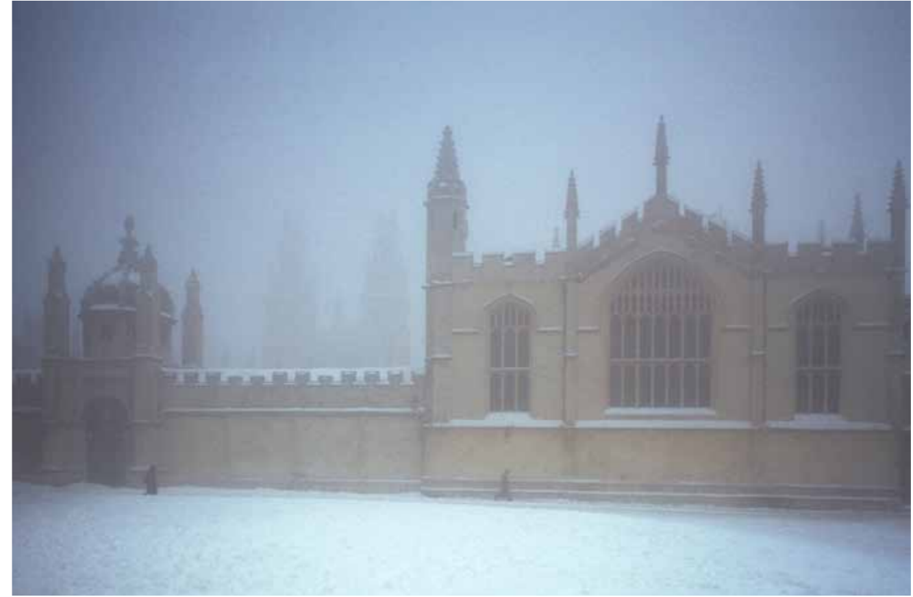
Left: All Souls College, Oxford, c1980s